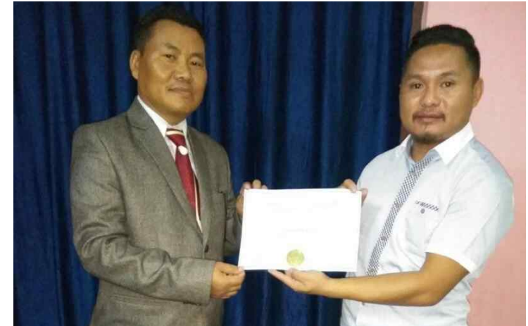
PIS is accredited College by IATA

Let's think what kind of benefits of group ministry: 1) There were synergy which means one plus one make not just two, but make four as we know, so a lot of energies moved in the church. 2) This was dynamics. It looks like flaming. Actually that church was very introverted means focused on the only maintenance and slept many years because they didn't know how to get up. But through the eleven lay pastors' group PACE ministry, they are totally changed. The church became really dynamics. 3) It was meaningful ministry and also valuable things to them those who were doing PACE. Some of them never used their spiritual gift for others and never gone for living for other people personally. But through involved in this ministry they find it's very meaningful to them. 4) Not only Lay Pastors but also others the rest of congregation are interested and encouraged to do same life style so decided to used